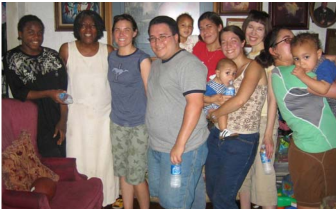
Immersion participants in St. Louis, June 2007