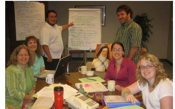
ASJP Team Meeting at Marianist Center in Dayton